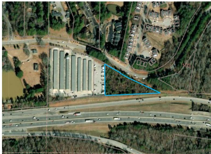
Blue outline indicates approximate parcel area.