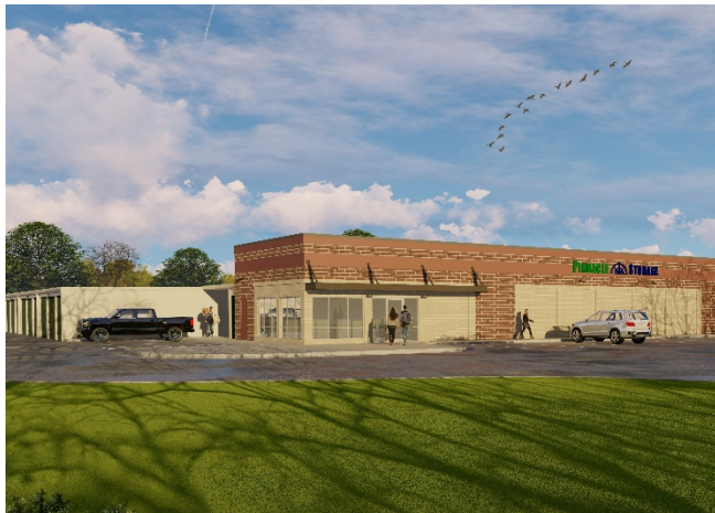
Photo is representative of a self storage property and not actual photo of this property.