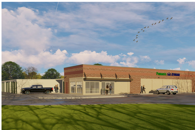
Photo is representative of property and not actual photo of property.